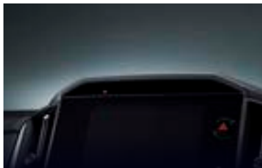
Driver Monitoring System