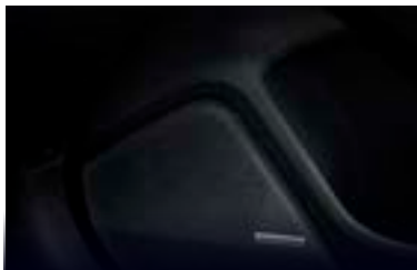
10 Harman Kardon® speakers, subwoofer and amplifier