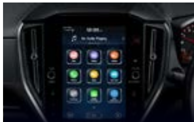
11,6" infotainment touch screen

Be the master of your own universe thanks to the tablet-like 11,6" infotainment touch screen with lightning-fast response and crystal clear, high-definition graphics. Tap into your contacts, send messages, bring up maps, select different driving modes, adjust the dual zone air-conditioning system and access compatible apps, news, music, podcasts and more. This advanced, multi-function infotainment control centre can be controlled with the mere power of your voice or the flick of a finger.