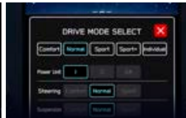
5 driving modes